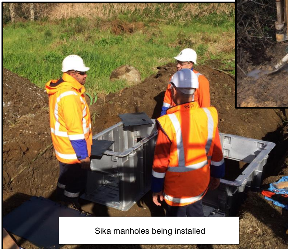
Sika manholes being installed